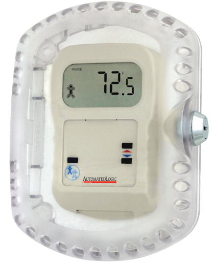
Thermostat Guard mounted over a thermostat